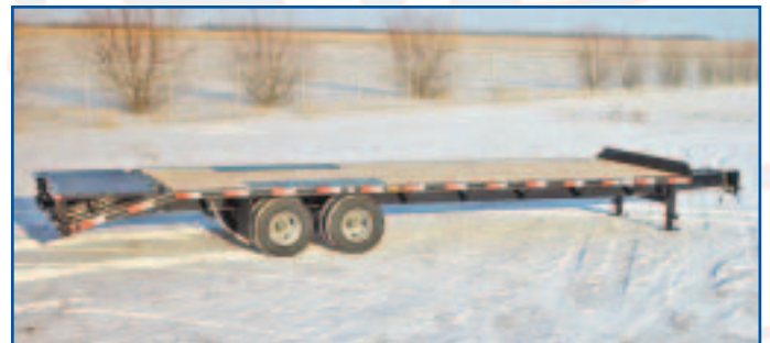
Bumper Hitch model also available