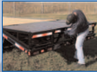
Checker plate on beavertails with center section flipped up allows for an additional 4 1/2' of deck space.