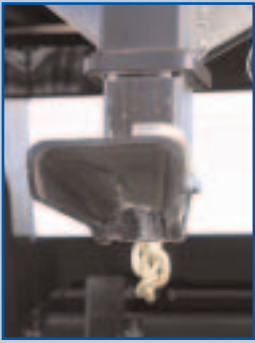
Norbert's own adjustable self-guiding coupler allows for effortless hook up.