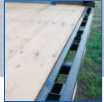
Tubular side rub rails are stronger and cleaner looking than traditional flat iron rails while also protecting light wiring.