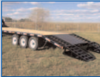
With ramps flipped and center section on greasable hinges dropped, objects can be loaded with ease.