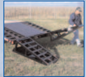
Beavertail ramps are lifted easily with spring assist and are adjustable for loading narrower objects.